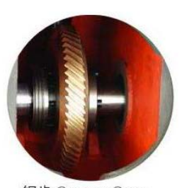
铜齿 Copper Gear