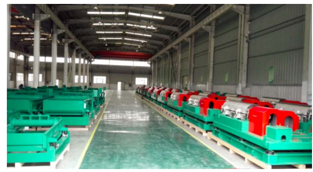
Warehouse & Stock