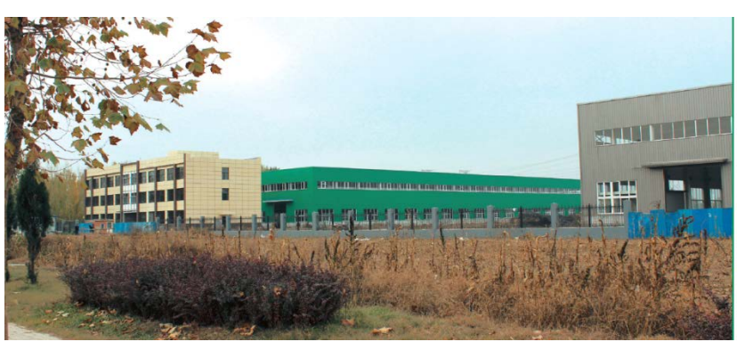
No. 2 Factory: Centrifuge & Pumps Manufacture